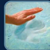
GEL VISCO LUMBAR SUPPORT