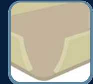
HIGH DENSITY FOAM ENCASEMENT